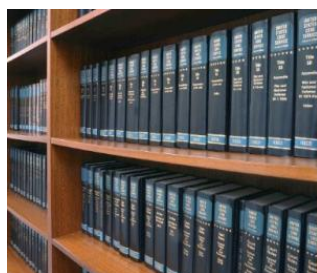
GAS ENGINE, VOLUME 5, ISSUES 7-12...